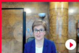
Nicola Sturgeon gives '100% assurance' on hairdressers reopening