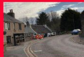
Car flips over barrier and smashes into house as Scots cops race to scene