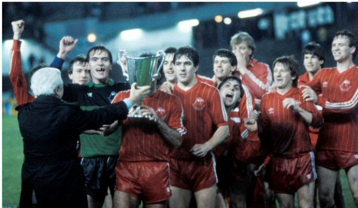
Aberdeen skipper Willie Miller is presented with with the European Cup Winners' Cup trophy after Aberdeen beat Real Madrid 2-1 in Gothenburg.