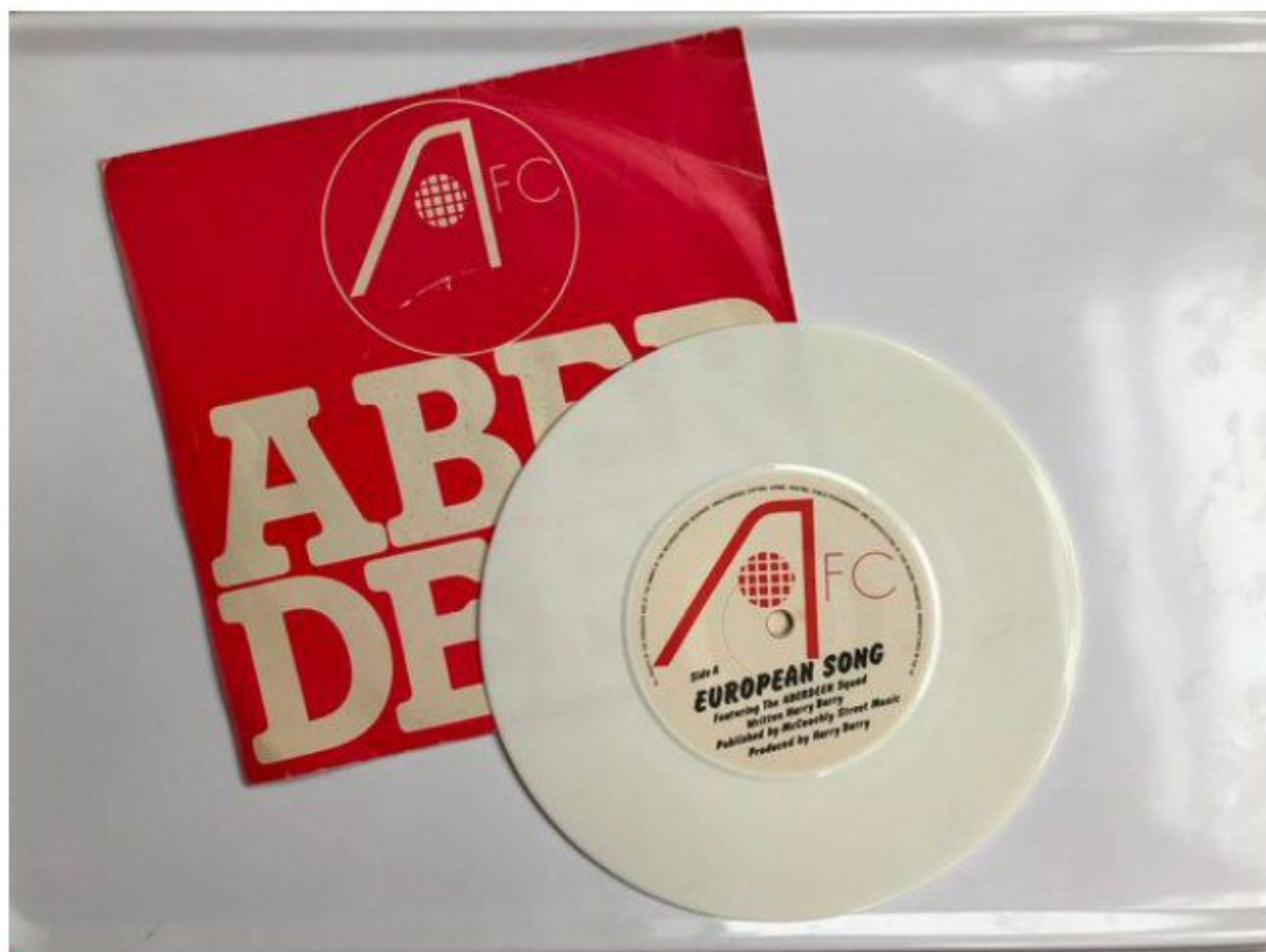
The record and sleeve.