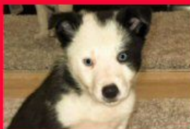
Third Border Collie pup dies after pooping 'blood and worms' at Scots home