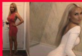
Heartbroken pals pay tribute to tragic young Edinburgh girl who died suddenly