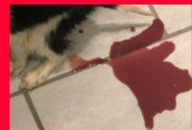
Border Collie puppy dies hours after 'breeders' drop pup off with Scots family